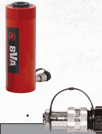
High-Flow Coupler: CH38F Included on all models

± Cylinder are equipped with carrying handles