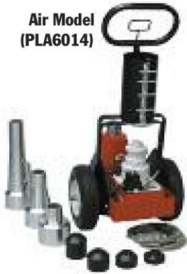
Air Model (PLA6014)