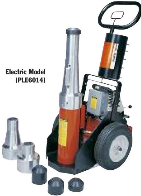
Electric Model (PLE6014)