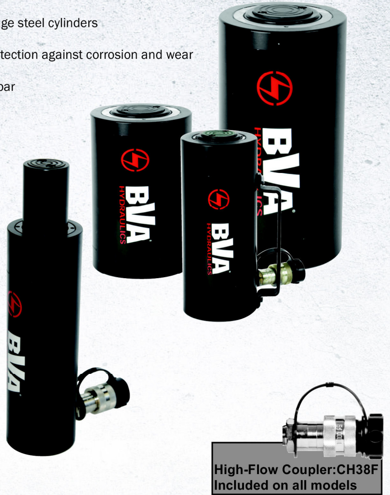
High-Flow Coupler: CH38F Included on all models