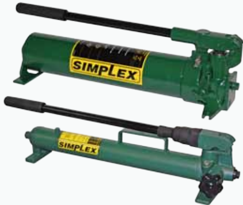
P82A, P41 Shown

Reservoir Capacity .....► 20 - 134 cu.in.